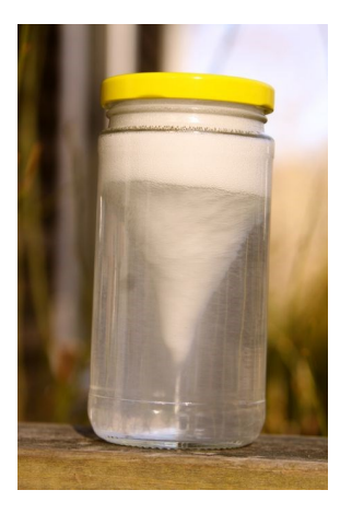
Idea and photo from elliemoon.typepad.com

Fill a clear plastic jar with water and squeeze a small amount of dish soap into the jar. Screw the lid on tight and shake it up. Watch the "tornado" form instantly.