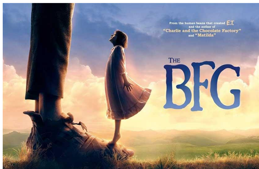
The series will continue December 2 with The BFG . ###