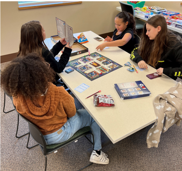
Above: Young patrons play games in the Clallam Bay Branch meeting room in 2023.

As a library tax district, the majority of NOLS' operating budget revenues come from property taxes. The 2024 levy rate is 29¢ per $1,000 of county assessed valuation, down from a 2023 levy rate of 31¢ per $1,000. Tax revenues are enhanced by use of investment income, reserves, and donations from Friends of the Library groups and other benefactors.