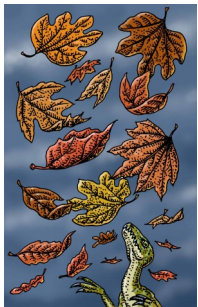
"Leaves of the Apocalypse" by Ray Troll