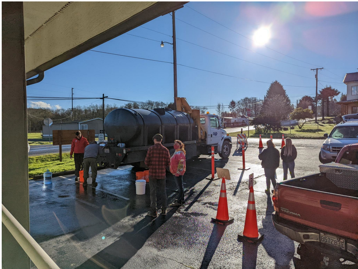
Water Truck at Clallam Bay Branch Library