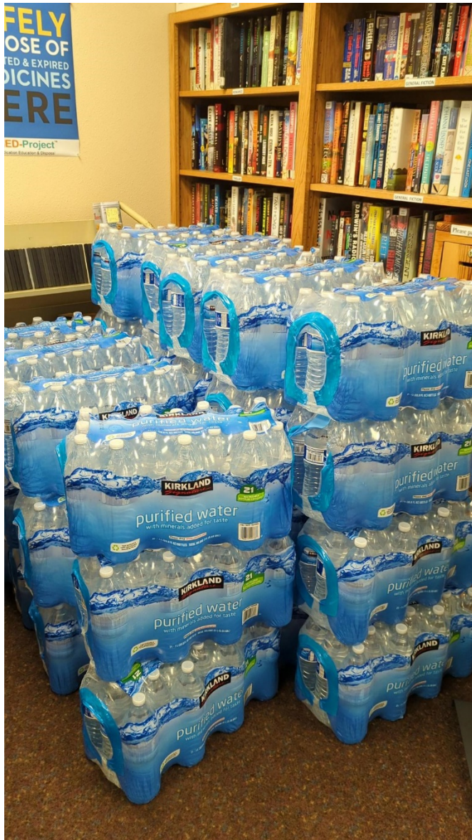
Water bottles stored at Clallam Bay Library for local residents.