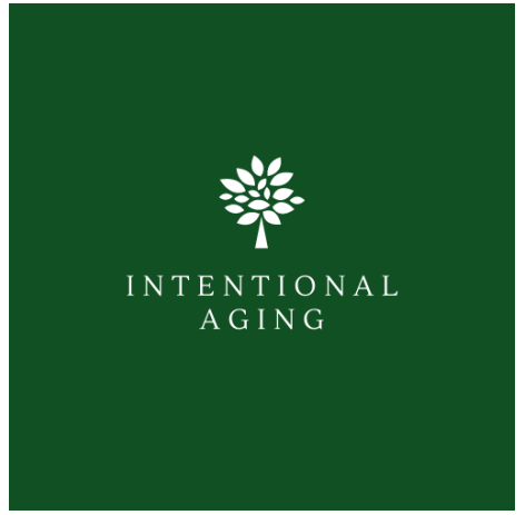
Intentional Aging series held monthly on Zoom. ###