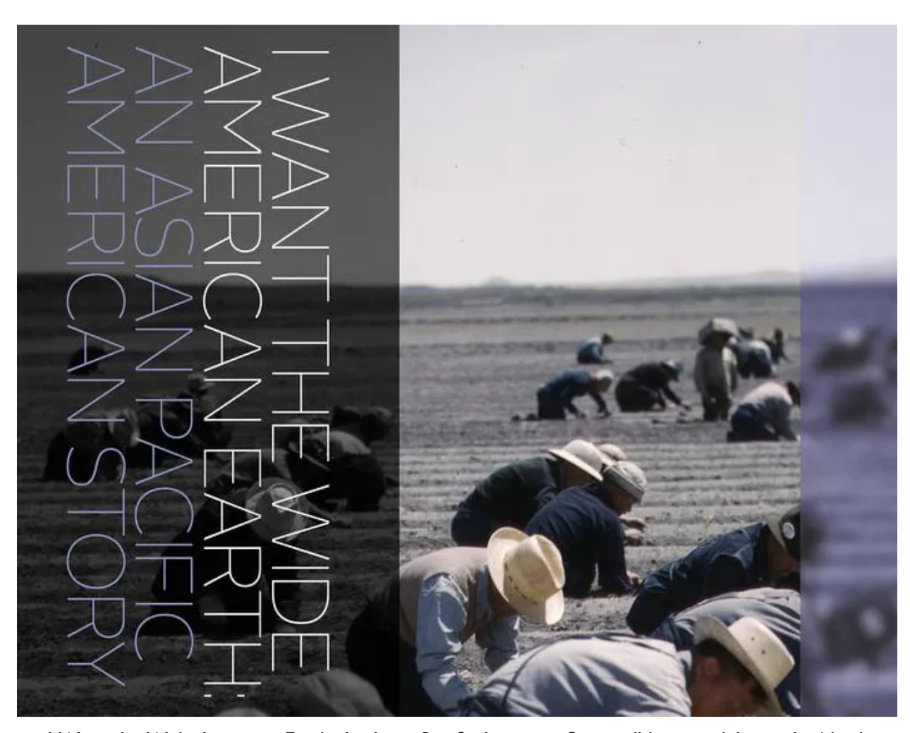
I Want the Wide American Earth: An Asian Pacific American Story will be on exhibit at the North Olympic Library System May through June 2022.