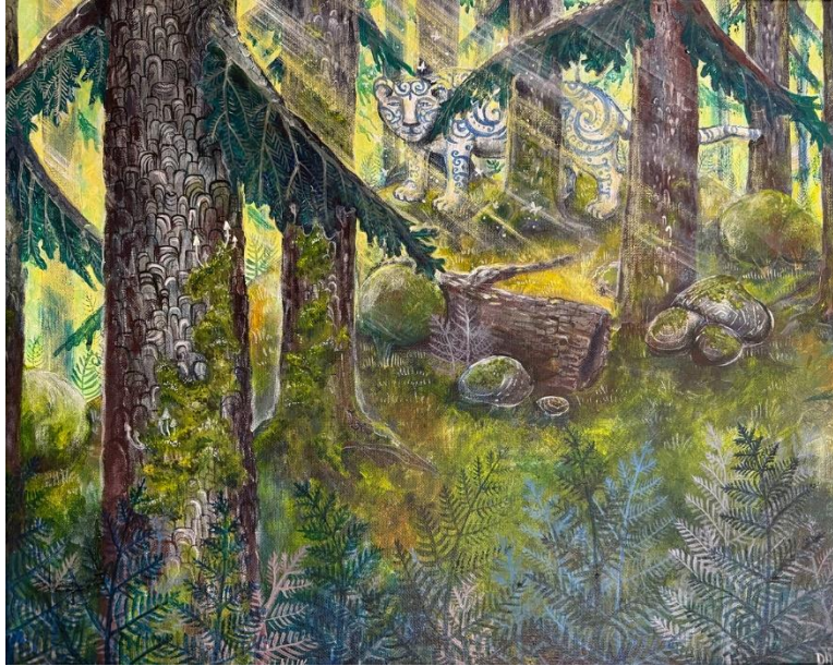
“Amba,” an acrylic on canvas painting by Daria Hunt, shows a giant tiger in a Pacific Northwest forest, inspired by dream imagery and folklore.