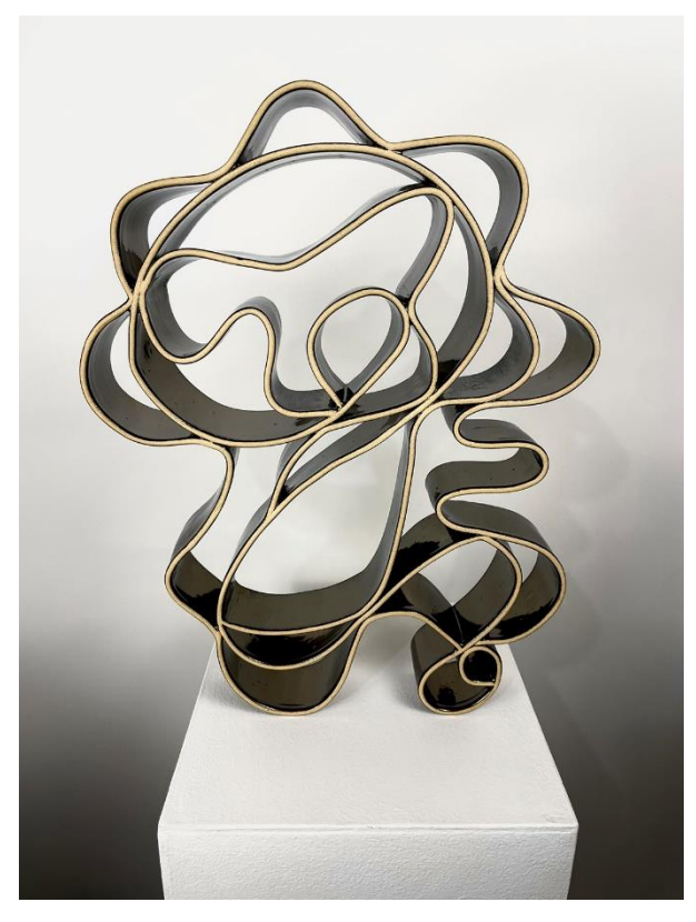
Ceramic sculpture "Big Wiggle – in Palladium" by Ariel Zimman.

For more information, visit <u>nols.org/art-in-the-library</u>, call 360-417-8500 or email <u>discover@nols.org</u>.