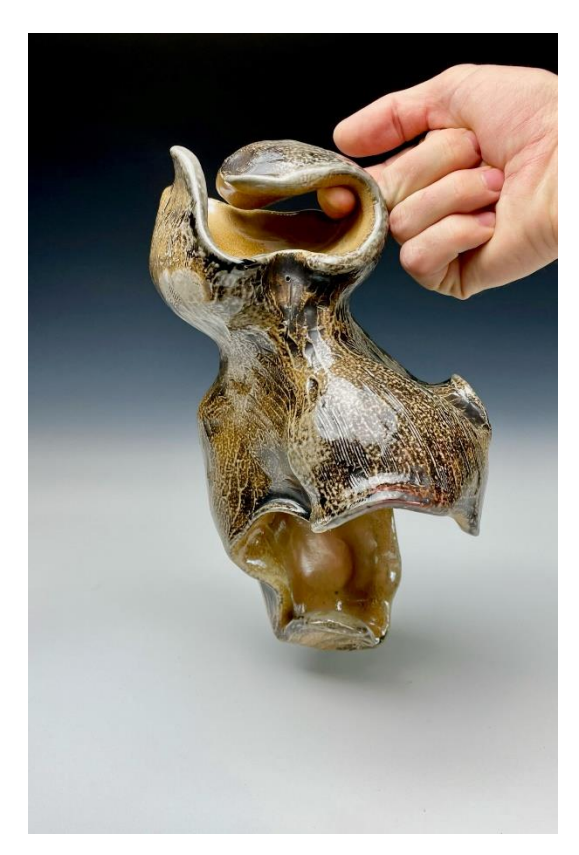
Ceramic sculpture "Flora-Fauna" by Thomas Connery. \#\ \#\ \#