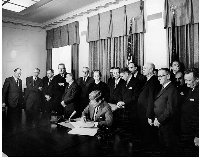
President John F. Kennedy signing legislation that allocated funds for new community mental health centers