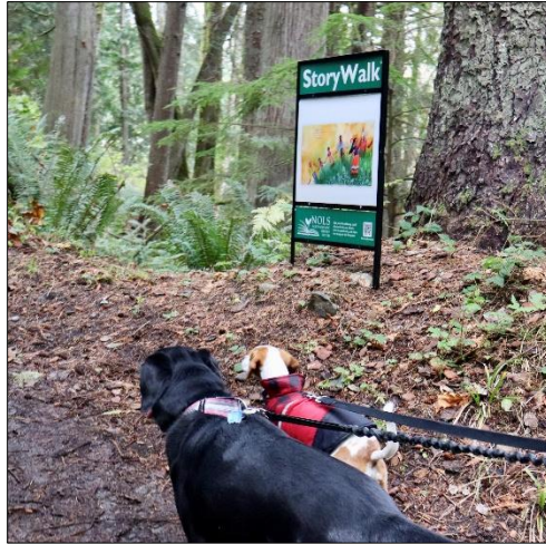
Four-legged visitors enjoying the StoryWalk at the Lyre Conservation Area in 2024.