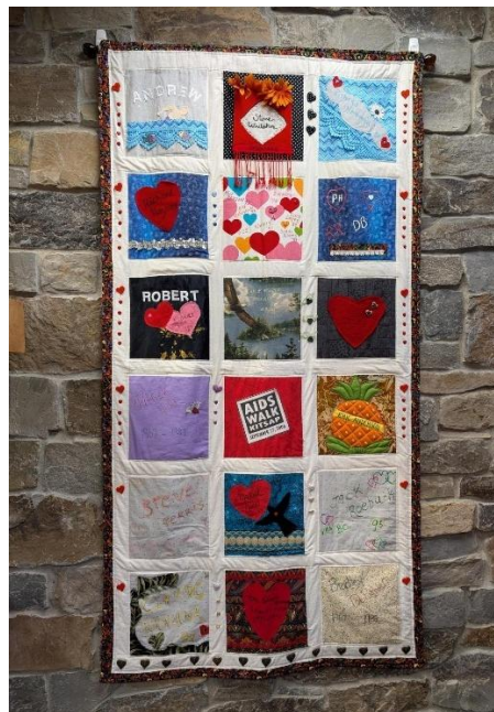
AIDS Memorial Quilt panels from Kitsap Public Health District are on display in Forks and Port Angeles libraries. Blank quilt squares are available for community members to personalize.