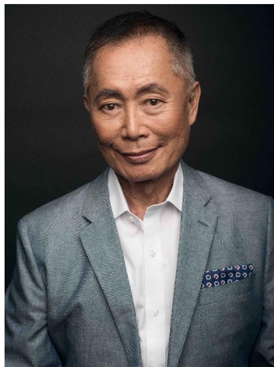
Actor/author/activist George Takei.

“They Called Us Enemy” by George Takei is available in print and digital formats through NOLS.