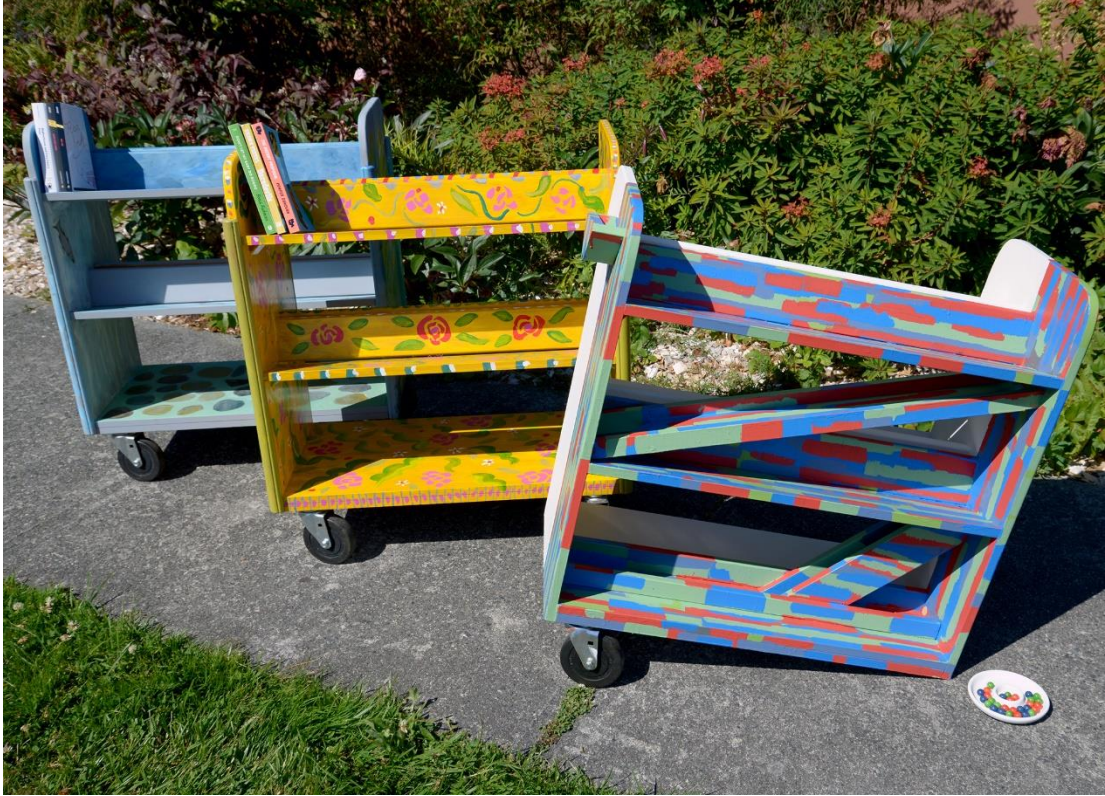
Part of the Art Cart fleet