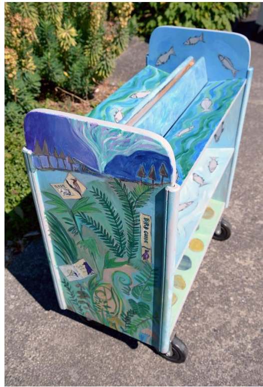
Art Cart designed by Monica Gutierrez-Quarto