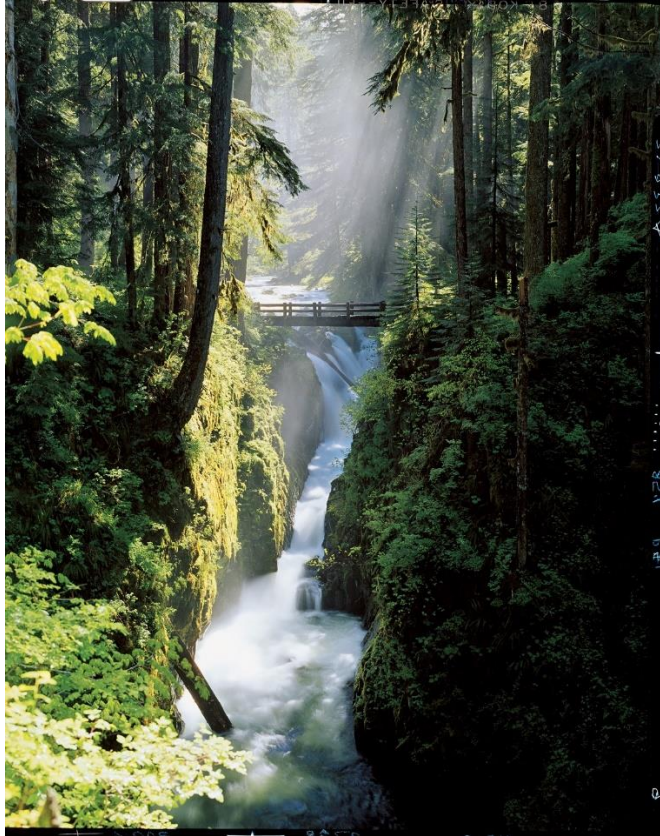
“Sol Duc Falls”