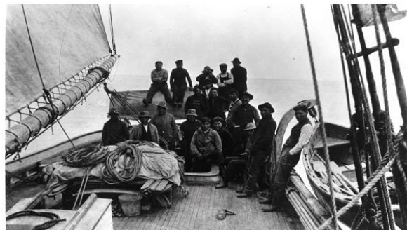
March 28: "Usual and Accustomed Places"