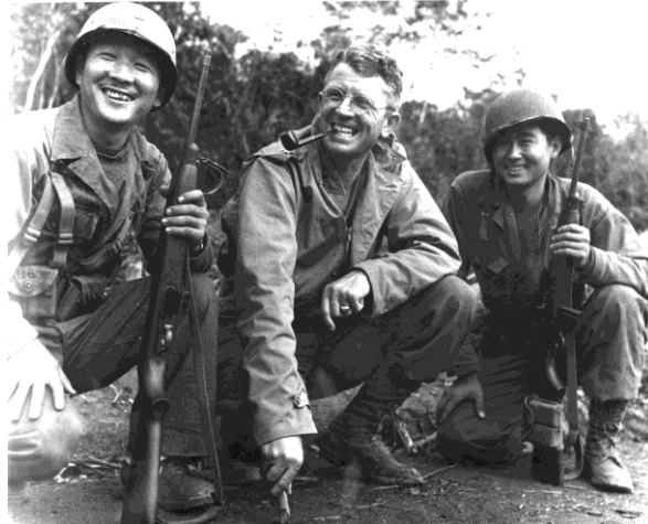
April 25: "The Color of Honor"