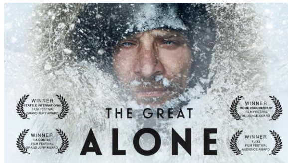
February 28: "The Great Alone"