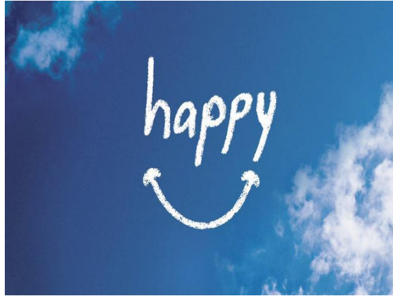
January 24: "Happy"