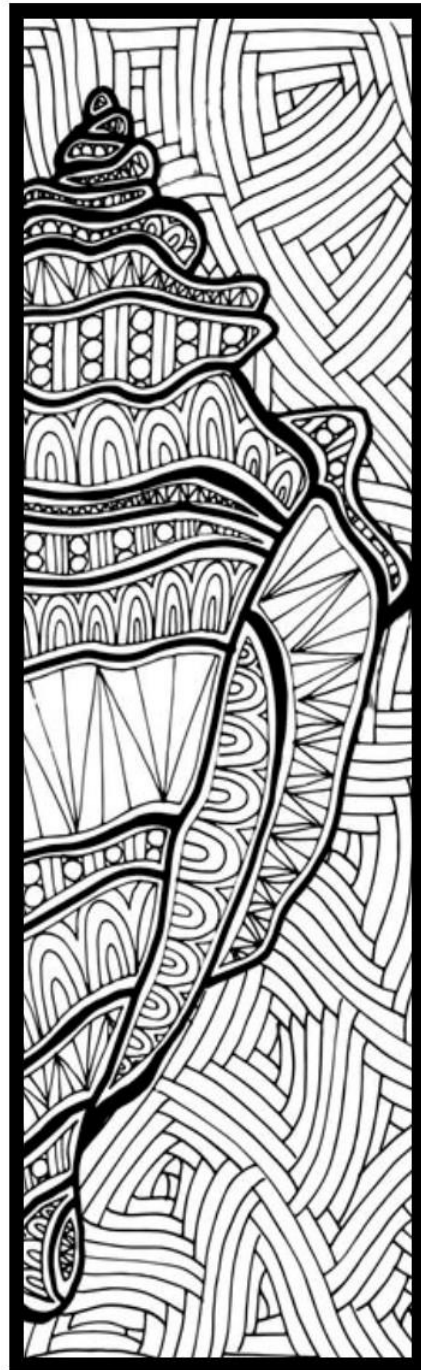
Pattern courtesy of thecoloringaddict.etsy.com

Love-themed, colorable bookmarks will be provided at this special event— just in time for Valentine’s Day!