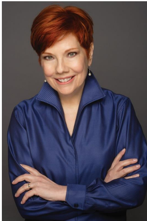
Author Jayne Ann Krentz to visit the Port Angeles Main Library.

The Port Angeles Main Library is located at 2210 South Peabody Street in Port Angeles. To learn more about this and other upcoming programs at the North Olympic Library System call the Port Angeles Main Library at 360.417.8500, send an email to Discover@nols.org , or visit www.nols.org , and select “Events.” This program is generously supported by the Port Angeles Friends of the Library.