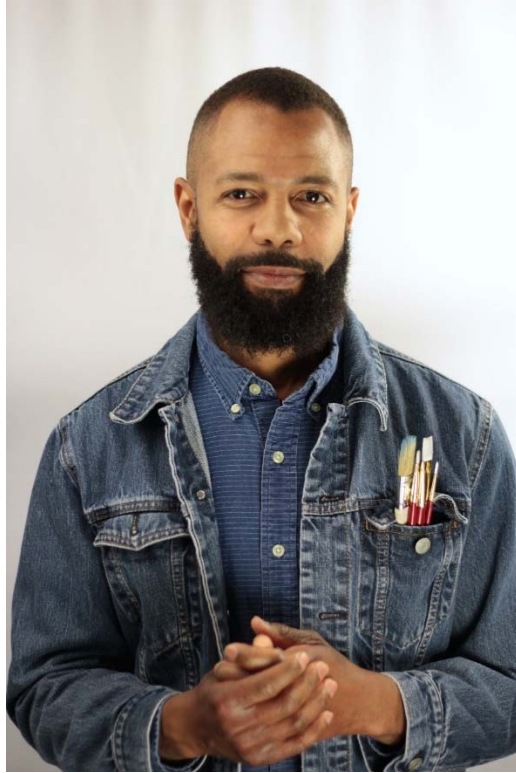
Author and Illustrator Javaka Steptoe