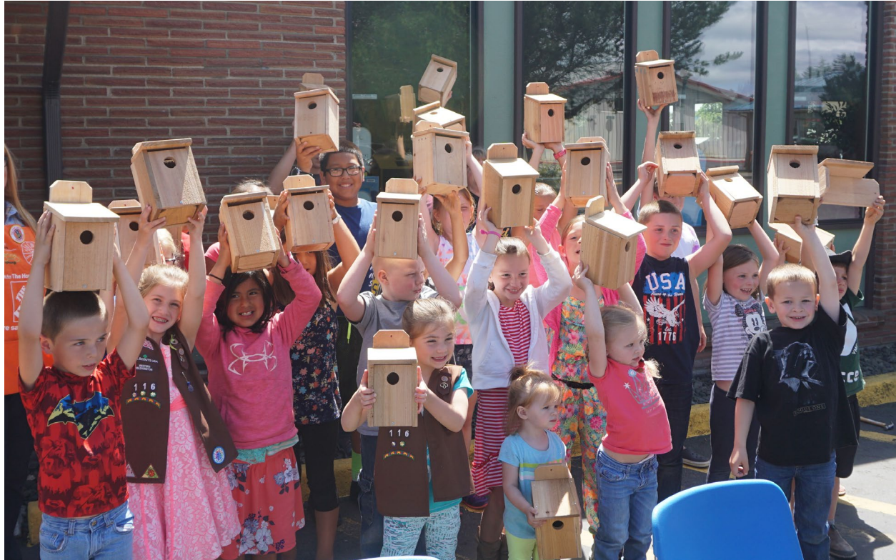
Children can build their own birdhouses on Saturday, June 15 at 2pm at the Forks Branch Library.

The Summer Reading Program is generously supported by the Friends of the Library at all four NOLS libraries. For more information about the Summer Reading Program and other events, visit www.nols.org/srp , call 360.417.8500, or email discover@nols.org .