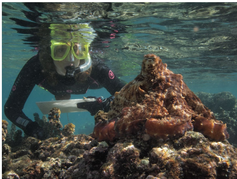
Sy and Cyanea

The Port Angeles Main Library is located at 2210 South Peabody Street. The Sequim Branch Library is located at 630 North Sequim Avenue.