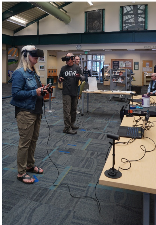
Patrons try Virtual Reality at the Port Angeles Main Library