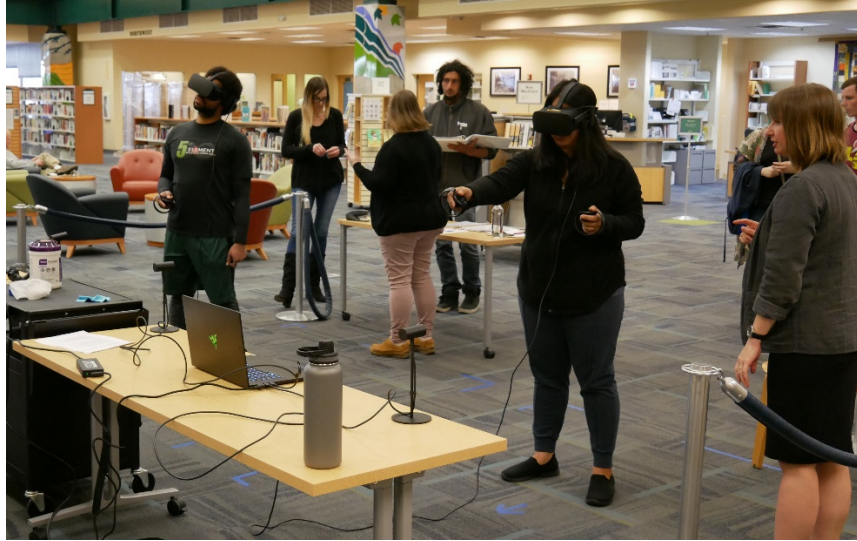
Patrons try Virtual Reality at the Port Angeles Main Library

For more information about this and other events happening at your Library, visit www.nols.org or email Discover@nols.org . The Forks Branch Library is located at 171 Forks Avenue South.