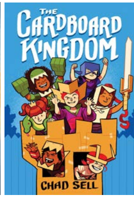
Battle of the Books 2022 is coming! ###